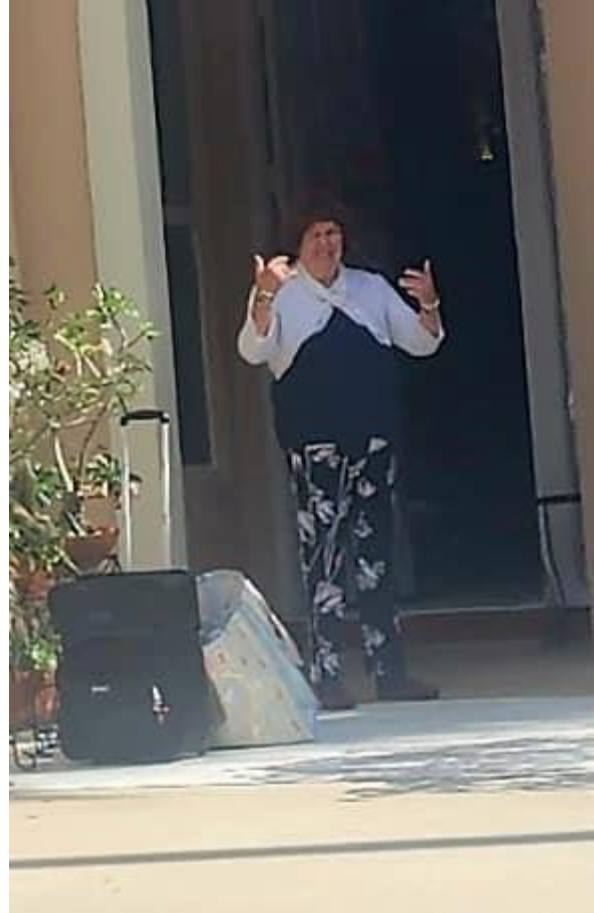
Gay at hotel

Meg getting ready to leave for convention