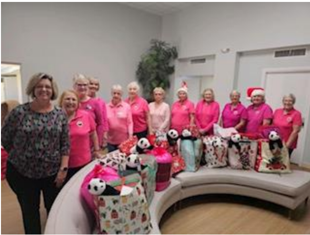
12/21 Santa brought a stocking with each girls' name on it to our girls at HomeSafe.