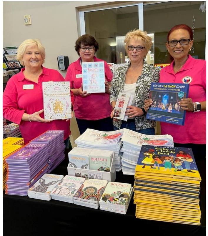
February 25 th – We will help give out books at Lake Worth Beach Street Painting Festival.